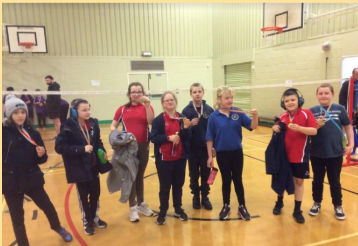
Blue 6's Badminton Festival trip

Blue 7 are collecting magazines for their enterprise work. If you have any spare magazines about clothes and fashion could you please send them in.