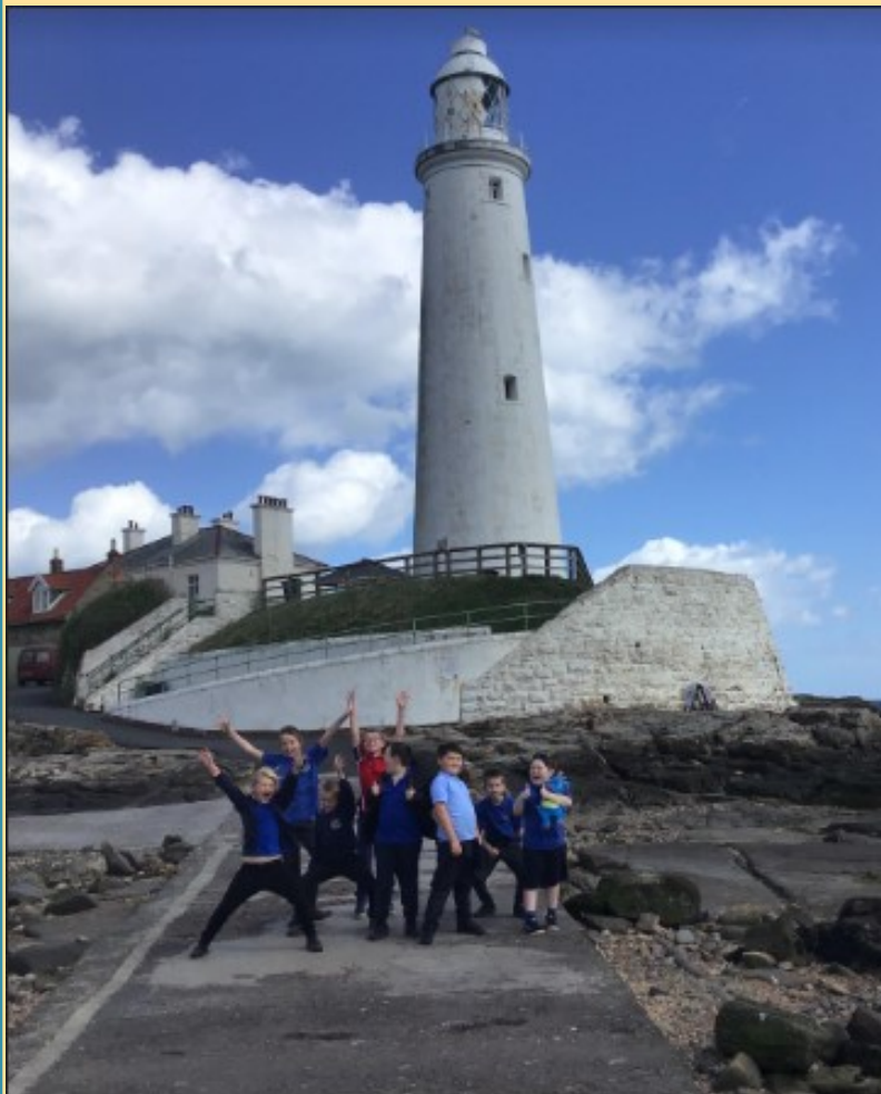
Blue 7's Lighthouse trip!

Blue 7 are collecting magazines for their enterprise work. If you have any spare magazines about clothes and fashion could you please send them in.